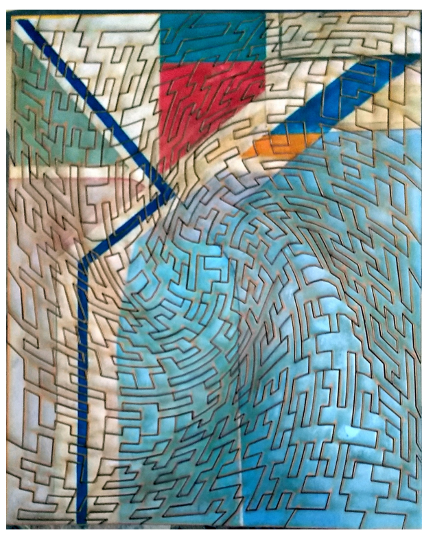
80-piece puzzle using swirl pattern. 8×10 printed photo was glued to wood before laser-cutting. (Image is Ocean Park #24 by Richard Diebenkorn.)