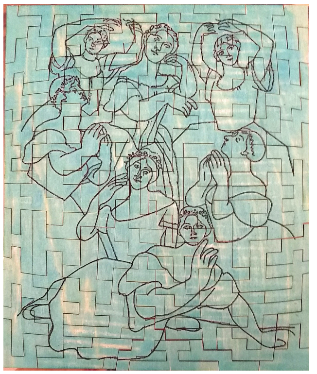
80-Piece puzzle with simpler part shapes, using a slight curve warping of the grid, 8×10 inches. (Etched image is Seven Ballerinas by Picasso.)