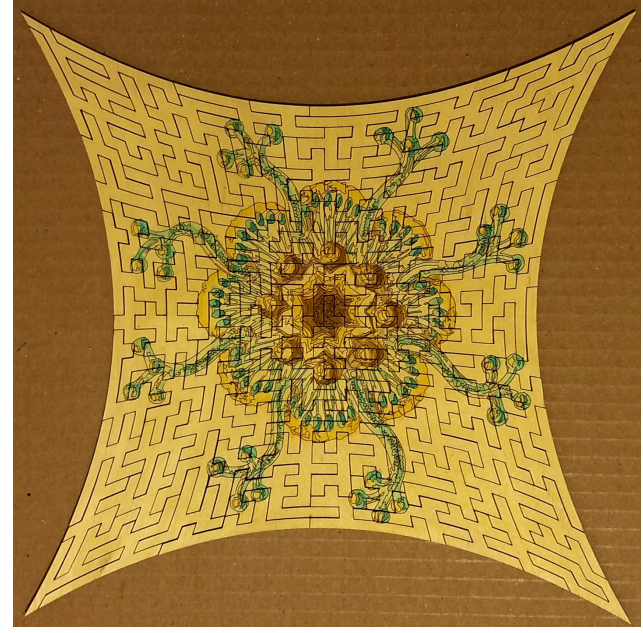
100-piece puzzle using contraction transformation of grid. Image is hand-painted based on Ernst Haeckel drawing of Siphonophorae from Artforms in Nature.

This family of puzzles can be adapted to any desired level of complexity by choosing the resolution of the underlying grid. An infinite variety of warping transformations can be coded up using straightforward mathematical techniques, to change the visual effect. Test-solvers report that these puzzles provide a fun solving experience. My G4G-14 exchange item is a small 25-piece puzzle with a bubble transformation. For more information, see: http://georgehart.com/jigsaw