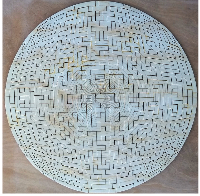
100-piece "tree rings" puzzle based on circular warping of grid. Laser-etched circles are scaled in geometric proportion.