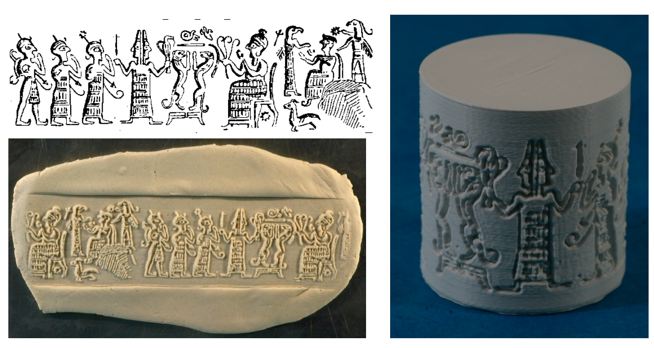
Figure 4: Hittite cylinder seal image with Janus, 3D printed roller, and Play-Doh impression.

There is a long history of carved stone rollers being used to make clay seals, e.g., to authenticate royal documents [8]. Numerous examples of intricately carved Sumerian, Hittite, or Mesopotamian cylinder seals going back to 3500BC can be found in museum collections. An exhibition of ancient Near Eastern cylinder seals at the Morgan Library in NY inspired us to begin this project. Figure 4 shows a drawing of a Hittite seal [9], a 3D-printed roller we derived from it, and a Play-Doh impression from the roller. In this case, we started from a modern line drawing of the seal, which indicates the contours of the figures, so our cylinder recreates these lines. However, the original 15<sup>th</sup> century BCE seal in the Louvre Museum [10] on which the drawing is based is actually a relief in the style of the following example.