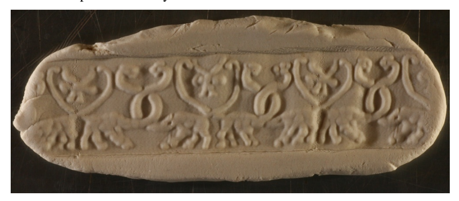
Figure 6: 3D-printed cylinder and Play-Doh impression, roughly reconstructing Figure 5.