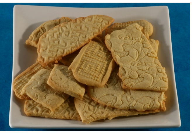
Figure 1: 3D-printed rollers (4 to 12 cm high) and sugar cookies with imprinted patterns.