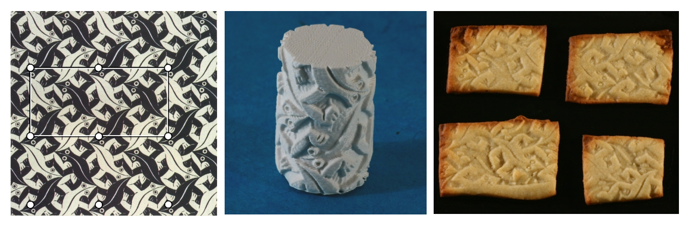
Figure 2: Escher image, "Lizard," 3D-printed roller, and sugar cookies.

These rollers are 4 to 12 cm high (when stood on end as shown) and are built from ABS plastic on a Makerbot "Replicator" 3D printer [5]. The STL files are freely available [3] so anyone can make copies of these rollers.