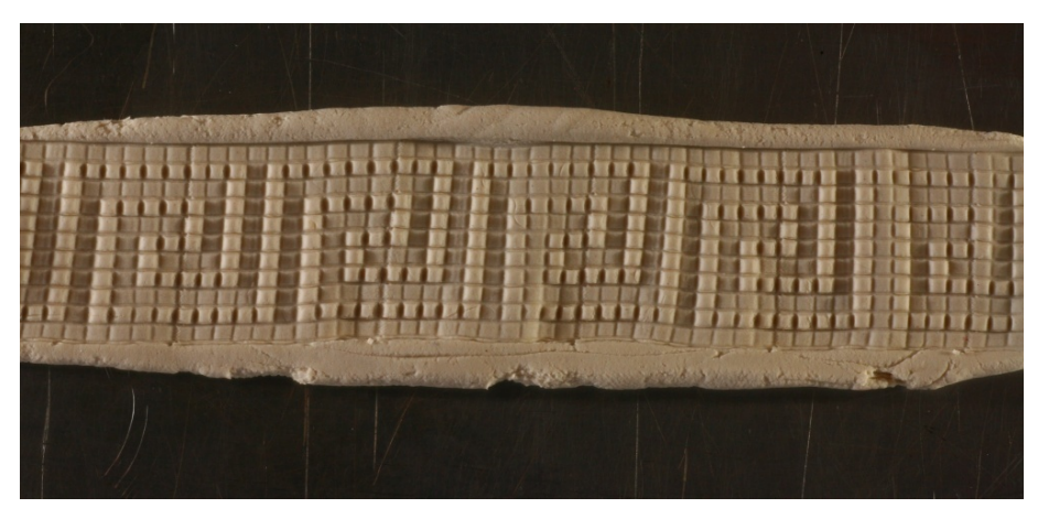
Figure 7: Greek Key mosaic unit drawing and resulting frieze pattern imprinted in Play-Doh.

Rollers for arbitrary frieze patterns can be produced by creating one translational unit of the pattern in a drawing program and feeding the image to the software. Figure 7 shows an example in which we created a mosaic-like image by stamping white and grey squares on a black background to create one unit of a classic "Greek Key" frieze pattern. The resulting roller has two heights of square tiles rising above the lower background of "grout" between the tiles. Some cookies made from this roller can be seen in Figure 1.