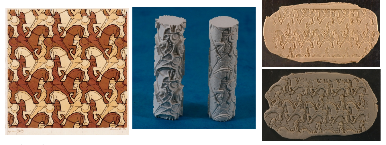
Figure 3: Escher "Horsemen," positive and negative 3D printed rollers, and their Play-Doh impressions.

The Escher image in Figure 2 consists of black and white reptiles [6]. A set of equivalent points are marked here with circles. The chosen point is the upper eye of a downward facing black reptile, but any point would do equally well to bound a fundamental region. A square bounded by four of these points could be used as a rubber stamp to produce the entire image using only translation. Because a square rolls up into a thin cylindrical shell that can be difficult to manipulate, the marked rectangle consisting of two squares was input to the software to produce the roller in Figure 2. It has two copies of the image, and twice the diameter of a roller based on a single square. The black and white regions of the image are translated into two levels of depth. A sugar cookie dough recipe [7] was rolled out and imprinted with the roller to make the cookies shown.