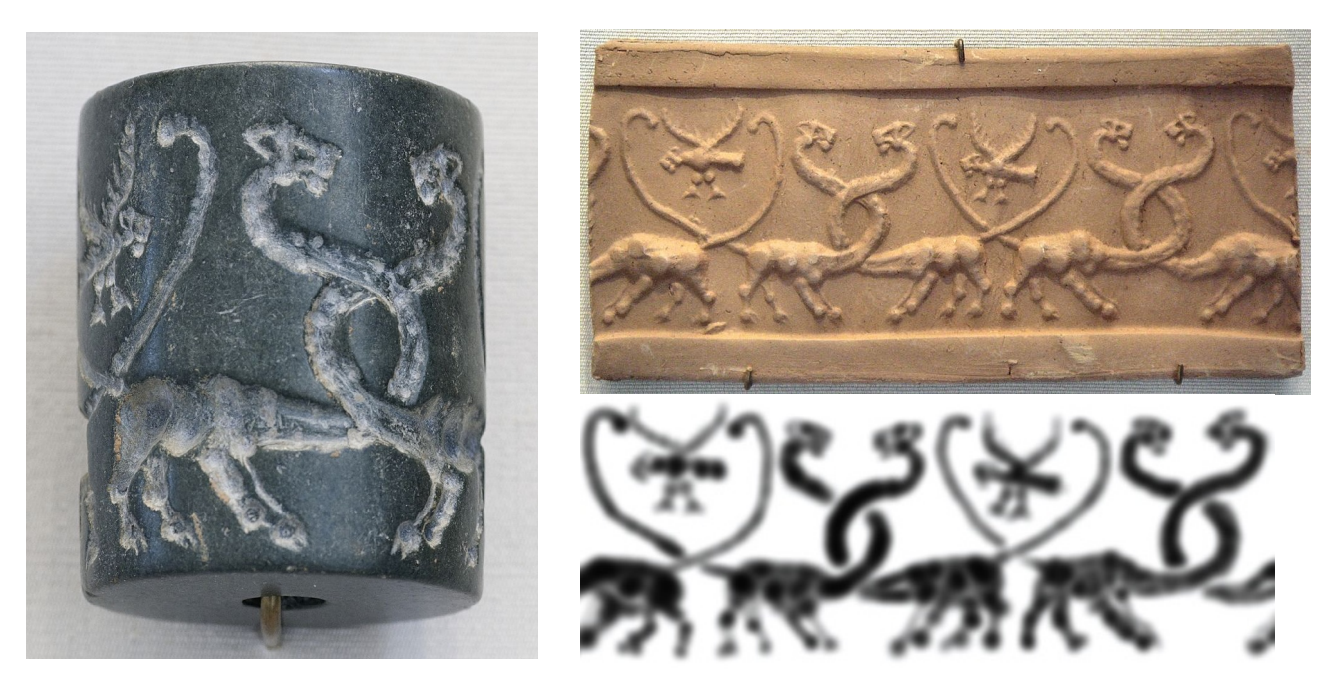
Figure 5: Mesopotamian cylinder seal, modern impression, and "depth map" reconstruction of one cycle.

There is a long history of carved stone rollers being used to make clay seals, e.g., to authenticate royal documents [8]. Numerous examples of intricately carved Sumerian, Hittite, or Mesopotamian cylinder seals going back to 3500BC can be found in museum collections. An exhibition of ancient Near Eastern cylinder seals at the Morgan Library in NY inspired us to begin this project. Figure 4 shows a drawing of a Hittite seal [9], a 3D-printed roller we derived from it, and a Play-Doh impression from the roller. In this case, we started from a modern line drawing of the seal, which indicates the contours of the figures, so our cylinder recreates these lines. However, the original 15<sup>th</sup> century BCE seal in the Louvre Museum [10] on which the drawing is based is actually a relief in the style of the following example.